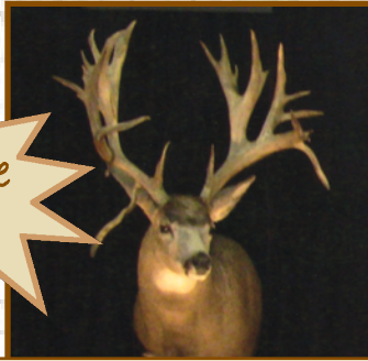
Eastmans' Deer Display